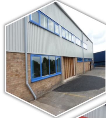
Front elevation before (left) and after (below).

Meanwhile, standard details were developed to streamline the design process, provide consistency, improve quality and reduce costs on future schemes.