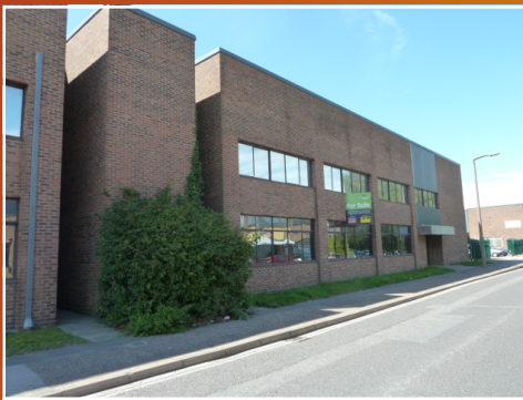
Pictured left and right: example photos of the property prior to acquisition.

Bradley-Mason LLP were appointed by Salts Healthcare in 2011 to produce an Acquisition Report for a property being acquired on a freehold basis for owner occupation. The site comprised of a 1,500 sq. ft open plan steel framed industrial unit which had been partly refurbished by the Landlord and was to be fitted out for the manufacture of health care products.